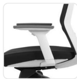
Multi Directional Adjustable Arms