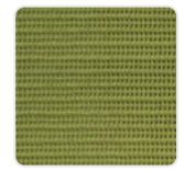
Green (special order)