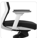
Standard Seat Foam