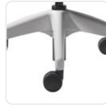
White Nylon Base