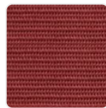
Red (special order)