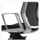
Flare Fixed Arms