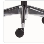
Polished Aluminium Base