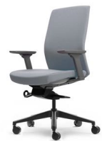
Aveya Fully Upholstered – Black