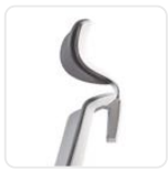
Headrest (White Outer / Grey Vinyl Inner)