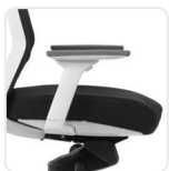
Plush Seat (Extra Foam)