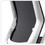
'INVISI' Adjustable Lumbar Support