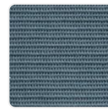
Steel Blue (special order)