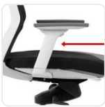
Adjustable Seat Depth