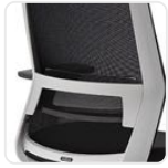
'BOOST' Adjustable Lumbar Support