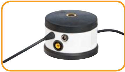
Digital converter outputs USB composite or SVideo

Users can view live images on a monitor or use the USB digital converter to view and capture videos on a PC. The orlvision is completely submersible for sterilization and disinfection or can be used with disposable sheaths. The integrated camera processor eliminates the need for a bulky external "processing box".