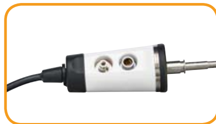
Standard Karl Storz light source adaptor