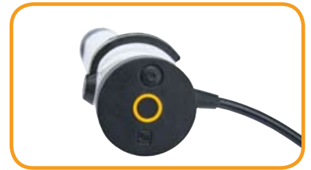
Built-in White Balance and capture buttons