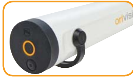
Easy Grip Articulation Lever