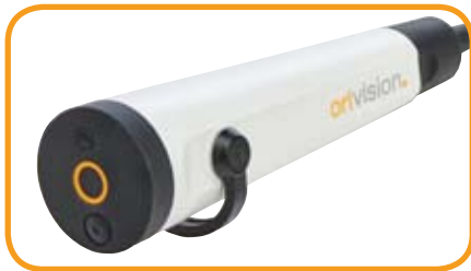
Integrated camera processor eliminates bulky box