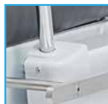
Standard bars for clinical accessories