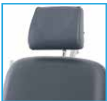
Ergo headrest with vario double joint

The OS1 gives you the opportunity to individualize your chair according to your precise needs.