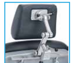
Any position can be fixed with a vario double joint