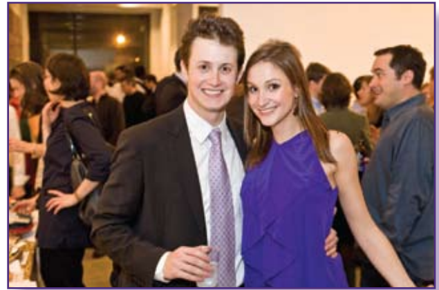
IBIRORI!, NYC, DEC. 11, 2008

In December 2008 , Indego Africa hosted Ibirori! – which means celebration in Kinyarwanda – in Washington, D.C. and New York City. The events, which were attended by more than 400 supporters, were vibrant and festive affairs, including a remarkable speech by the Rwandan Ambassador to the U.S., James Kimonyo; the debut of the Faces of Indego Africa photo exhibit; farm-fresh ice cream; live music; incredible silent auction items, including VIP tickets to the Daily Show; Indego Africa's entire suite of handicrafts; and a special tribute to Indego Africa from the great people at the Travel Channel. Thanks to everyone who organized these wonderful events and to all who braved the terrible weather to attend!