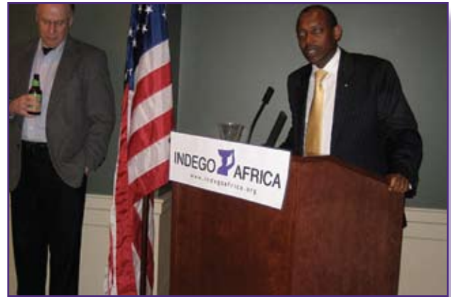
IBIRORI!, WASHINGTON, D.C., DEC. 3, 2008

To learn more about past and upcoming events, go to http://indegoafrica.org/fundraisers