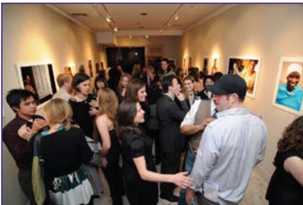
FACES OF INDEGO AFRICA, NYC, MARCH 26, 2009