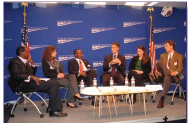
15 YEARS LATER, WASHINGTON, D.C., APRIL 1, 2009