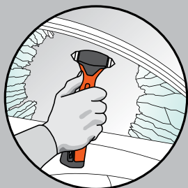
BREAKING CAR GLASS