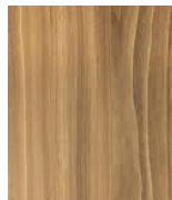
Walnut wood (Oiled or varnished)