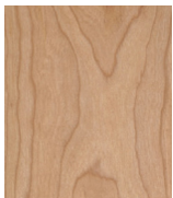
Cherry wood (Oiled or varnished)