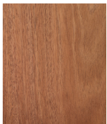
Tzalam wood (Oiled or varnished)