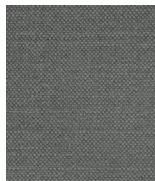
Cloth color gray 60% cotton 40% linen