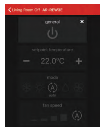
Program OFF scenario: Living Room OFF Press 'general' power button (to gray out all items)