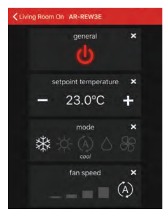
Program ON scenario: Living Room ON Setpoint Temp: 23°C, Mode: Cool Fan Speed: Auto

Program the ON and OFF scenarios<sup>#</sup> then manually activate at the touch of a button.