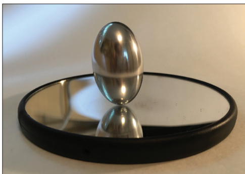
Fig. 1 An upright PhiTOP® spinning on a curved mirror.

to minor axes, which is equal to the golden mean \Phi = (1 + \sqrt{5})/2 \sim 1.618 . It functions in the same way as a spinning egg or a spinning football in that it rises on one end if it is initially set spinning