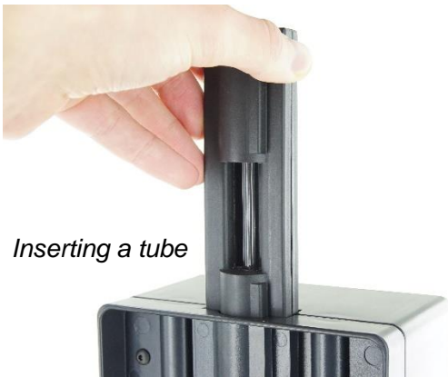
Inserting a tube

Insert the lower end of the tube into the insertion aperture and slide the tube all the way down into the well so that it seats in the recess at the bottom of the well. You should hear and feel a positive click as the magnetic interlock system engages.