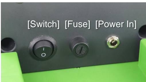
Power Supply - back

The back of the power supply carries the power input socket, the fuse, and the on/off switch. Insert the output connector of the wall mount power supply into the main power supply input socket.