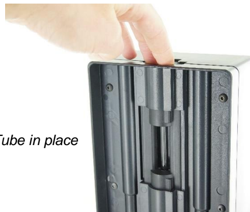
Tube in place