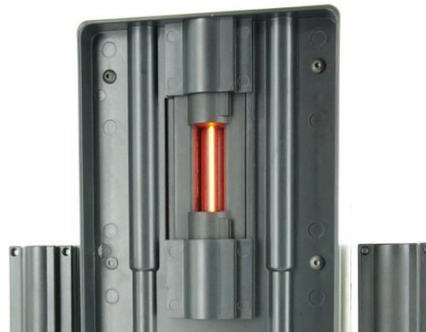
Tube at energizing station

Do not touch the hot tube that has just been running!