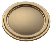
Satin Brass - RL060186