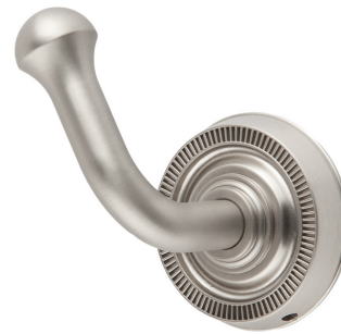
Satin Nickel - RL060162