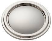
Polished Nickel - RL060179