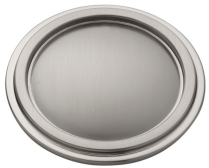
Satin Nickel - RL021996