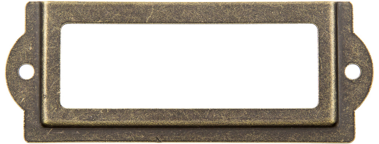
Antique Brass - RL021866