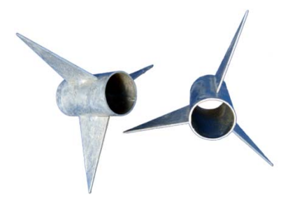
Rotating Spiked Vanes / Blades Prod Ref: PS ROTSPV

For fixing to Palisade Fencing, the Flat type brackets as shown below, offer a great solution.