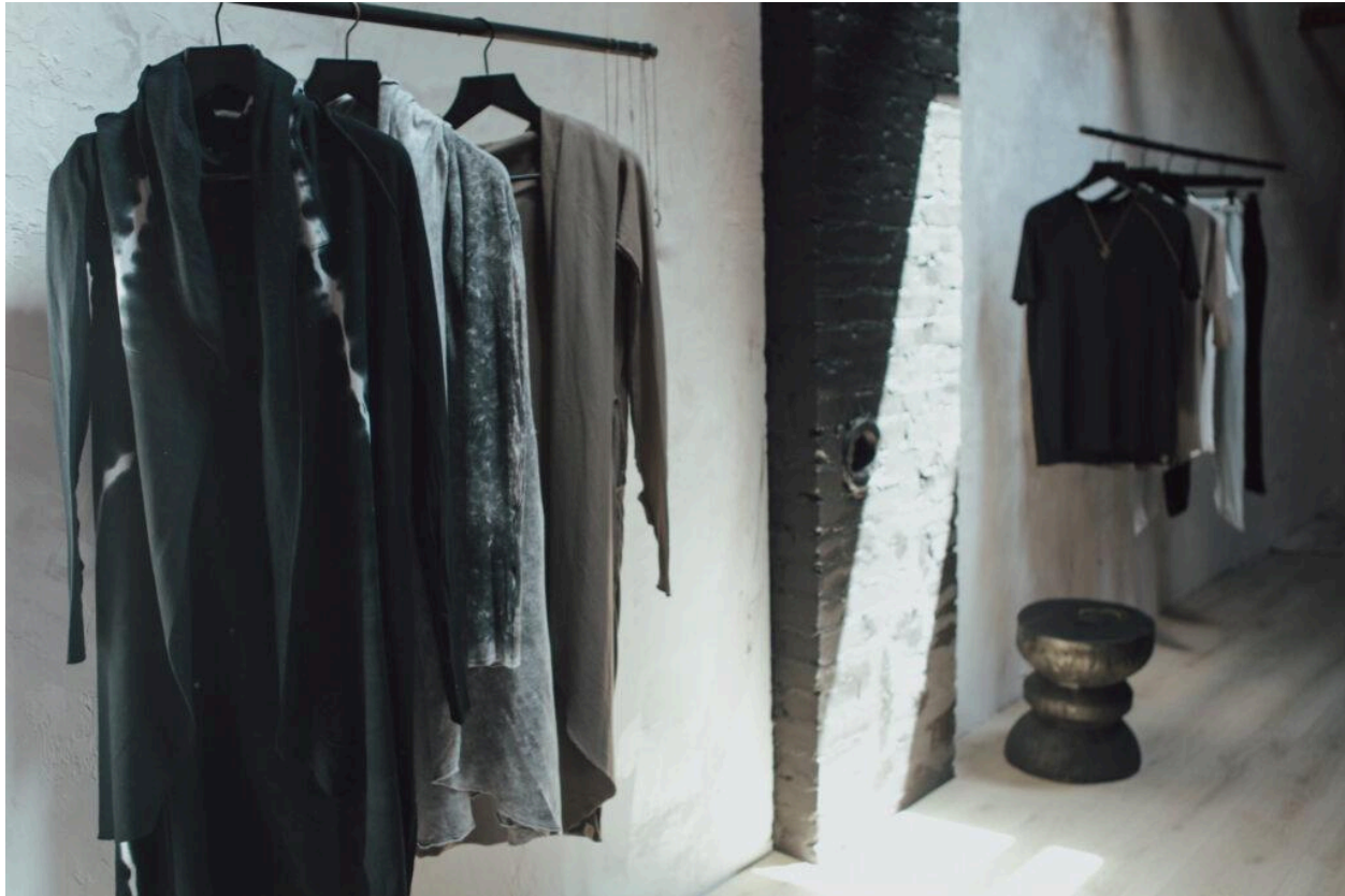
One Golden Thread’s new retail location opens this month