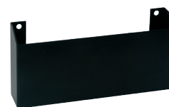
Wall holder for loop amplifier