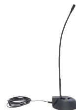
M-2 goose neck microphone