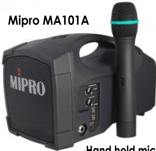
Hand held microphone