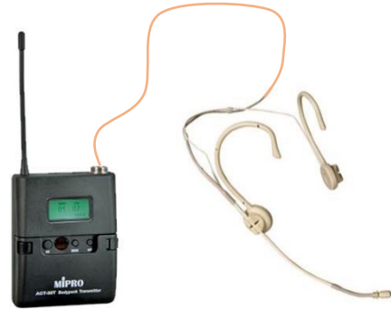
Belt Pack Transmitter & Head worn microphone

Rechargeable lithium battery for improved reliability, longer life, reduce weight and higher performance. Choose from either handheld transmitter microphone or belt pack transmitter with headset microphone option.