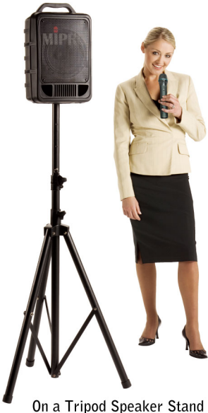
On a Tripod Speaker Stand