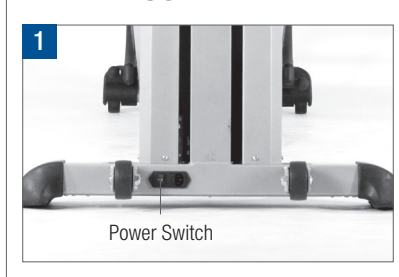
STEP 1. Turn the power switch to the "Off" position on the back base of the PowerTower unit.