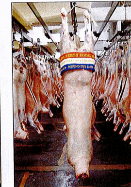
The champion carcass from a Merino dam was a Suffolk-Merino cross exhibited by the WA College of Agriculture Narrogin.