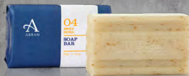
Honey & Oatmeal Soap 40g

Finishing touches make all the difference. Surprise guests with a few well-chosen luxury gifts at the end of the day.