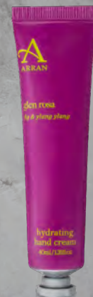
Hydrating Hand Cream 40ml

Available in; After the Rain, Glenashdale & Glen Rosa.