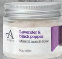
Lavender & Black pepper Mineral muscle soak 50g