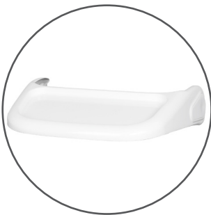
Feeding Tray x1