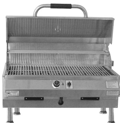
32" MODEL IS 4400-EC-448-TT-S-32 (SINGLE CONTROL)

Required Outlet: NEMA 6-50R Receptacle 208/220 Volt 50 Amp receptacle 50/60 Hz (use with 40 Amp breaker)