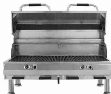
48" MODEL IS 8800-EC-1056-TT-D-48

Required Outlet: Nema 6-20R Receptacle 208/220 Volt 20 Amp receptacle 50/60 Hz