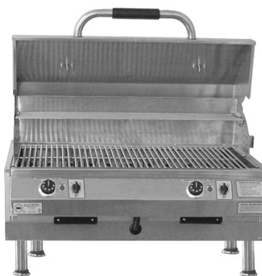
32" MODEL IS 4400-EC-448-TT-D-32 (DUAL CONTROL)

Required Outlet: NEMA 6-30R Receptacle 208/220 Volt 30 Amp receptacle 50/60 Hz