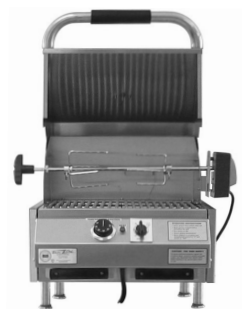
16" MODEL IS 4400-EC-224-TT-16