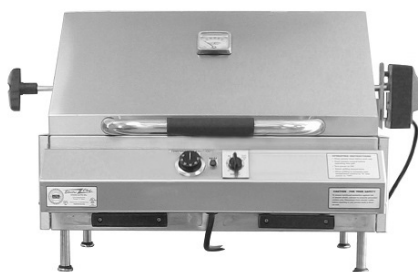
24" MODEL IS 4400-EC-336-TT-24

Required Outlet: Nema 6-20R Receptacle 208/220 Volt 20 Amp receptacle 50/60 Hz