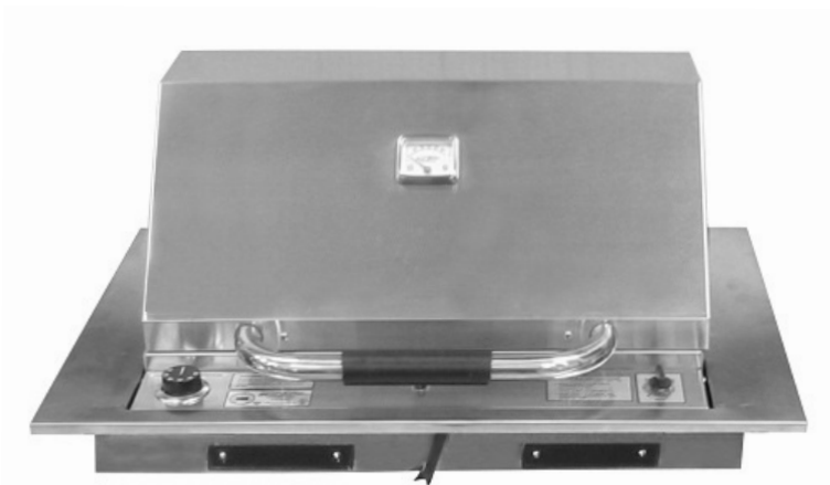
24" MODEL IS 4400-EC-336-JACT-24