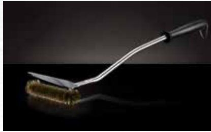
BRASS BRISTLE WIDE GRILL BRUSH