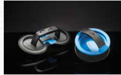
GOURMET BURGER PRESS KIT