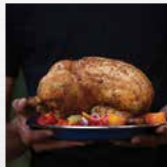
High-Top Lid for Larger Cuts of Meat