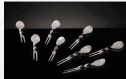
APPETIZER SERVING SET AND CORN FORKS