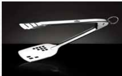
STAINLESS STEEL SPATUTONG