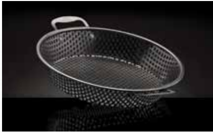
STAINLESS STEEL GRILLING WOK