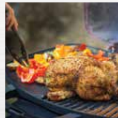
Large Grilling Area