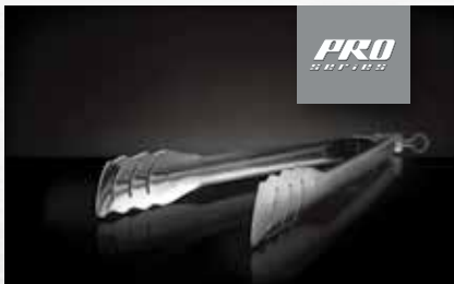
STAINLESS STEEL EASY LOCKING TONGS