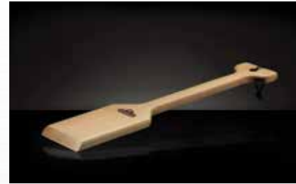
CEDAR GRILL SCRAPER