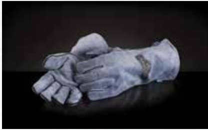
GENUINE LEATHER BBQ GLOVES