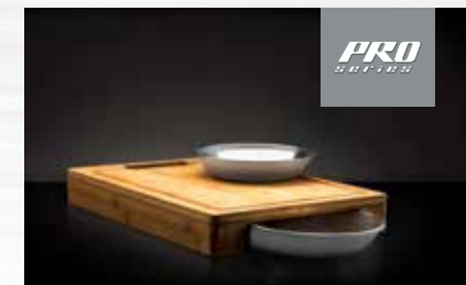
PRO CUTTING BOARD AND BOWL SET