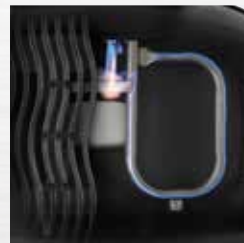
Advanced Cooking System