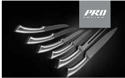
PROFESSIONAL KNIFE / CARVING SET