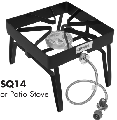
SQ14 Outdoor Patio Stove