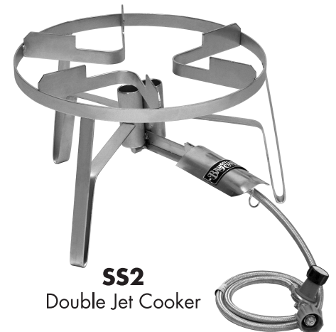
SS2 Double Jet Cooker