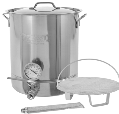
Stainless Steel Brew Kettle Equipment