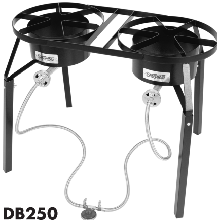
DB250 Dual Burner High Pressure Cooker