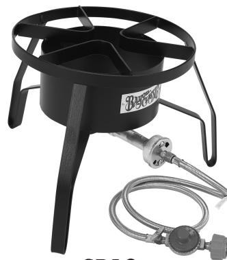
SP10 High Pressure Cooker