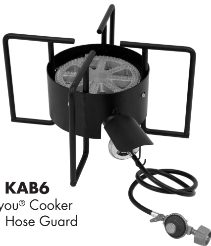
KAB6 Bayou® Cooker with Hose Guard