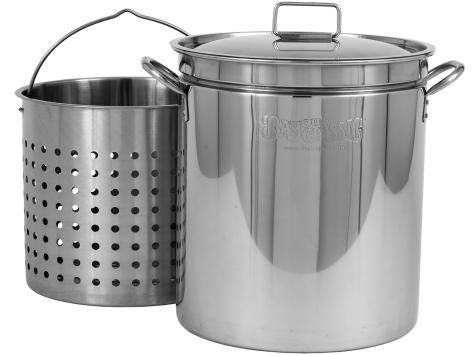
Stainless Steel and Aluminum Stockpots 24-Qt. - 162-Qt.