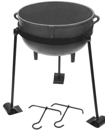
Jambalaya Kits 4-Gal. to 30 Gal.