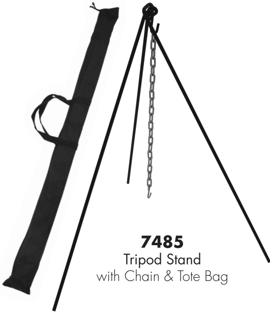
7485 Tripod Stand with Chain & Tote Bag