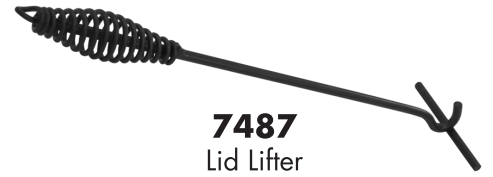
7487 Lid Lifter for Dutch Ovens