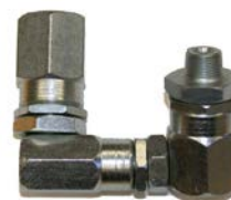
"Z" Swivel 1545