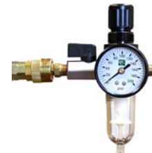
Air Filter, Regulator, Gauge Pkg. 1559A-ASSY