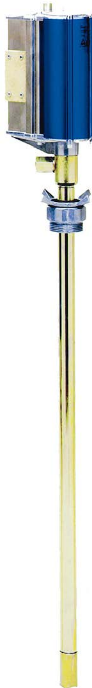
3574AAR Pump ONLY no accessories

Portable style complete system with all parts shown for pumping grease from 35-50 lb. pail