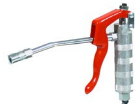
Control Handle 1536A