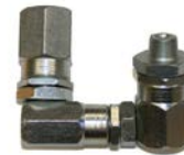
"Z" Swivel 1545