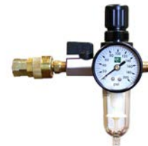
Regulator Combination Unit 1559A-ASSY