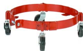
Drum Dolly 120-S