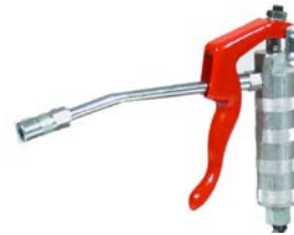
Control Handle 1536A