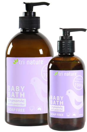
LAVENDER & CHAMOMILE