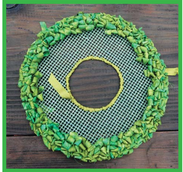
Partially locker hooked wreath, painted canvas

Finish: Take shimmering white ribbon or other color. Double up and tie around wreath to create a bow. Enjoy your wreath as as a door accent, or make two for table accents and customize with your own choice in colors!