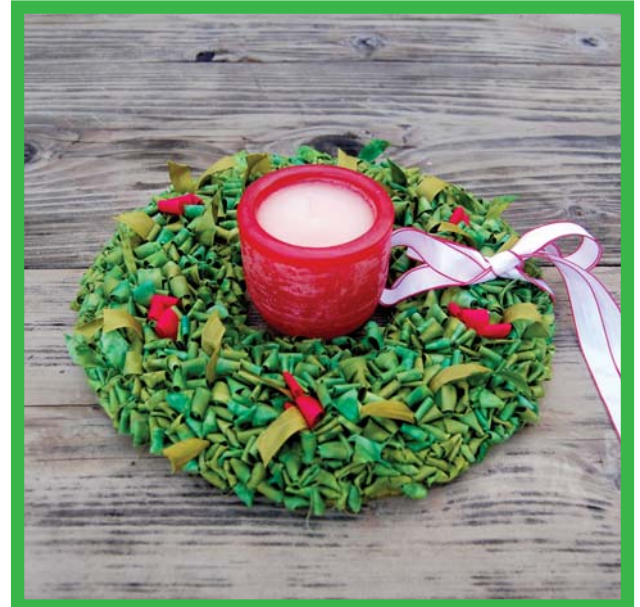
Use as a table accent with pillar candle