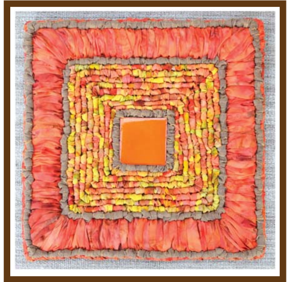
Autumn Leaves Color Crazy Mat Kit