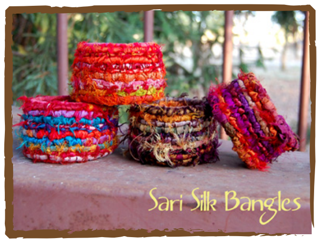
Sari Silk Bangles