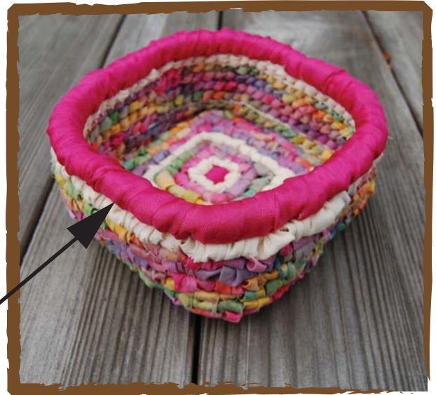
Cotton & Ribbon

Use ribbon to wrap top locker hooked row and stitch center loop on bottom to accent.