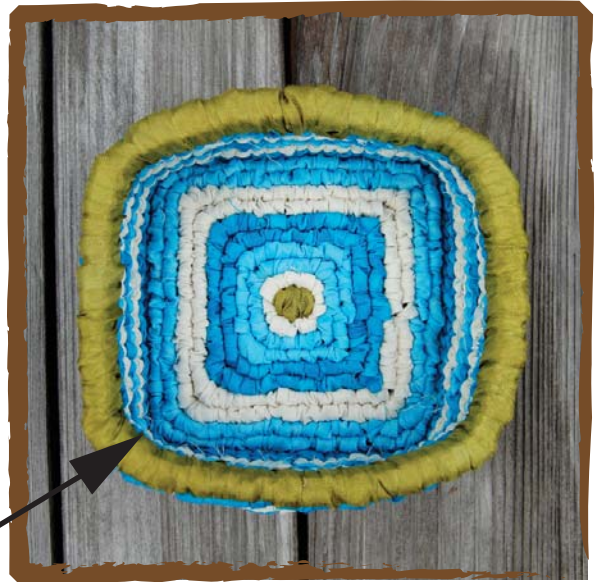
Cotton & Ribbon

Use muslin for locker hook top 2 rows of basket design. Use ribbon to wrap top 2 rows and stitch over 4 center loops on bottom to accent.