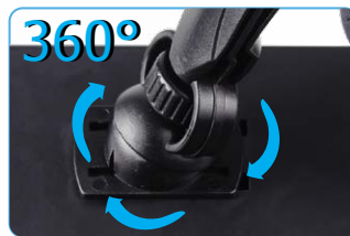
360° Degree Rotation