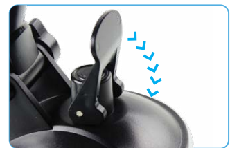
Push the Clasp to setup