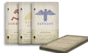
9 LOYALTY CARDS