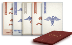
60 PROPAGANDA CARDS