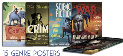
15 GENRE POSTERS