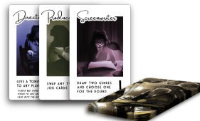
9 JOB CARDS