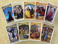
9 Character Cards