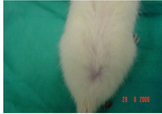
Fig. 1. In the study groups, alopecia was seen in the third week of the study.

Alopecia was seen in the subjects of 13.3% of VPA-B1 ( n = 2), 13.3% of VPA-B2 ( n = 2), and 40% of VPA ( n = 6). In the control group, alopecia was not observed (Fig. 2). There is a statistically significant differences between the groups with respect to alopecia ( p = 0.028). The statistical significance is due to the dif-