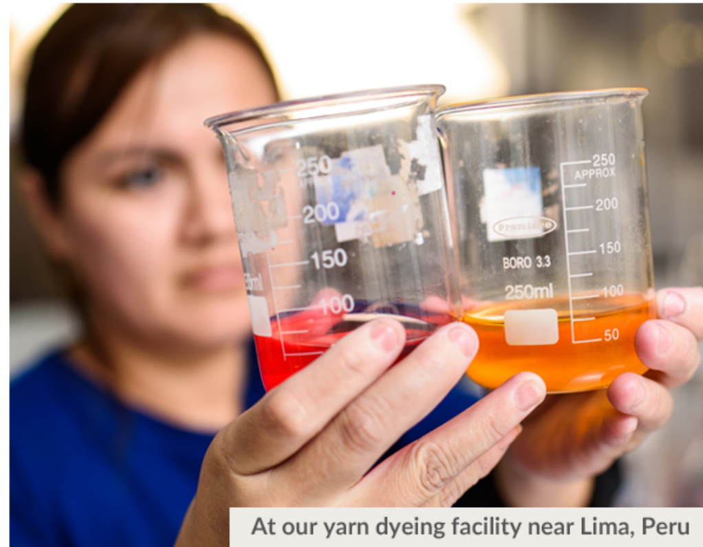
At our yarn dyeing facility near Lima, Peru

Our dyes exceed the US Consumer Product Safety Improvement Act (CPSIA) regarding lead and the European Chemical Regulation (REACH).