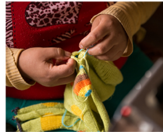
Irma applying her incredible knitting skills to production of Huggy the Bear