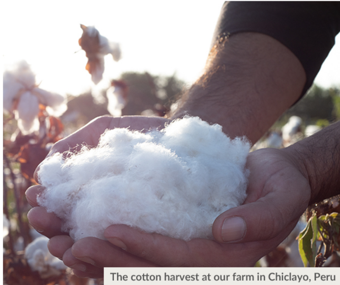
The cotton harvest at our farm in Chiclayo, Peru

The family that owns and operates these farms also runs the business that coordinates the hand knitting of the dolls across dozens of small worker-owned cooperatives.