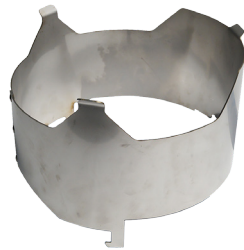
Heat Concentrating Flame Collimator