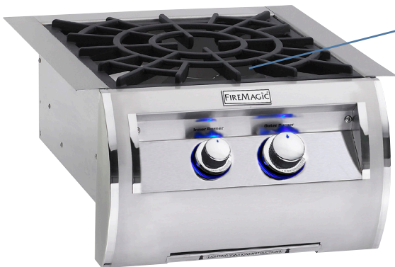
Echelon Power Burner with cast iron grids. Also available with stainless steel grids.