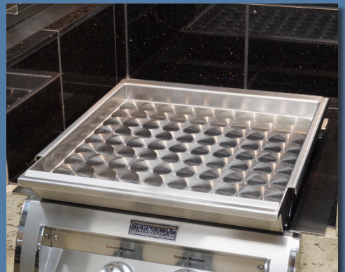
Power Burner shown with Large S.S. Griddle and New Griddle Adapter