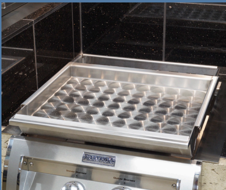
Power Burner shown with Small S.S. Griddle and New Griddle Adapter

New Griddle Adapter allows you to use both sizes of Stainless Steel Griddles on your Fire Magic® Power Burner.