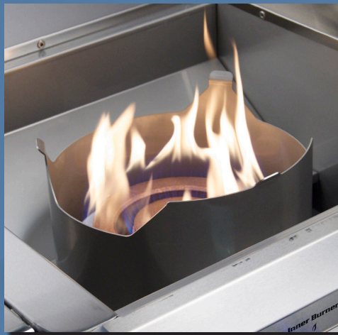
Heat Concentrating Flame Collimator