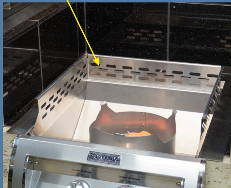
Power Burner shown with Griddle Adapter