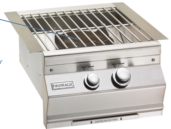
Aurora Power Burner with stainless steel grids. Also available with cast iron grids.