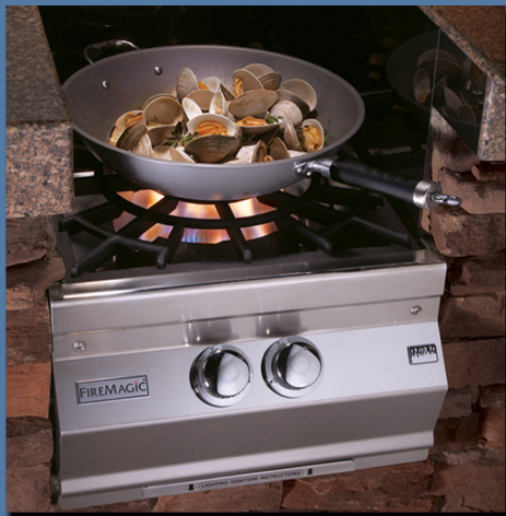
Power Burner shown as offset in grill