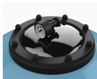
▪ Black top lid with screws