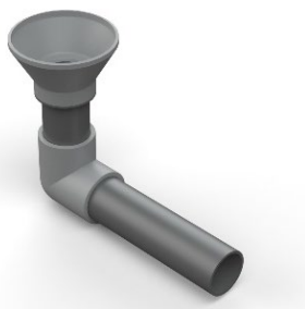
▪ Cone diffuser