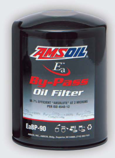
EaBP90 • EaBP100 • EaBP110 • EaBP120

AMSOIL Ea Bypass Oil Filters provide maximum filtration protection against wear and oil contamination. Working in conjunction with the engine's full-flow oil filter, AMSOIL Ea Bypass Filters operate by filtering oil on a "partial-flow" basis. They draw approximately 10 percent of the oil sump's capacity at any one time and trap the extremely small, wear-causing contaminants that full-flow filters can't remove. AMSOIL Ea Bypass Filters typically filter all of the oil in the system several times an hour, so the engine continuously receives analytically clean oil.