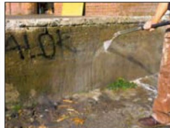
Rinse off product with a small pressure washer or a stiff-bristled brush