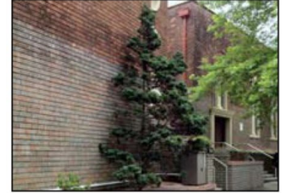
So-called 'permanent' coating turned cloudy

https://www.youtube.com/watch?v=x53WB54TZ2c