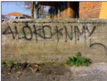
Using Bare Brick, Stone & Masonry Graffiti Remover