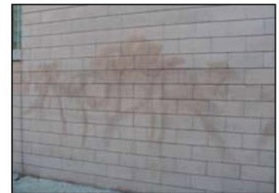
This 'anti-graffiti' coating actually made removal even more difficult in the long-term