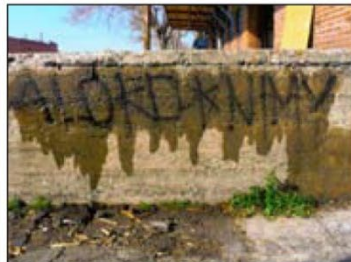
Brush, broom or spray on; 3 coats at 3 minute intervals