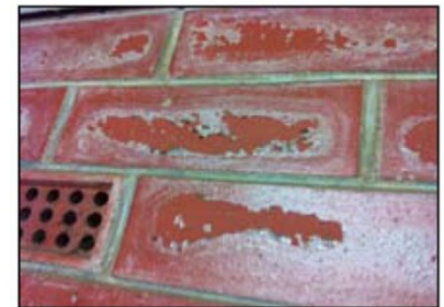
'Anti-graffiti' coating peeling/de-laminating