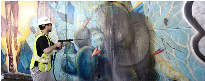
Cleaning graffiti after using MURALSHIELD in conjunction with WORLD'S BEST COATING.

Step 5 Apply two coats of WORLD'S BEST GRAFFITI COATING by spray, roller, or brush.