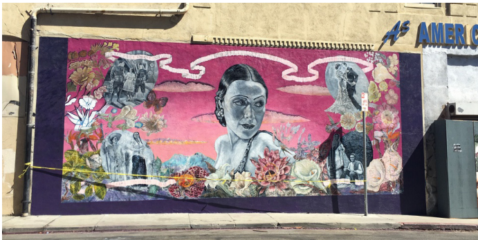
SPARC mural restoration, Hollywood CA

MURALSHIELD is designed for the protection and conservation of fine art acrylic murals. It offers UV protection, consolidation, and weatherproofing. MURALSHIELD will restore weathered, uncoated murals, and is recommended for the preservation of new acrylic and aerosol murals.