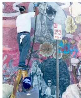
MURALSHIELD being applied with HVLP sprayer