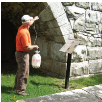
Handheld Pump-up Sprayer

Rapid, single-step application, 1 or 2 wet on wet layers.