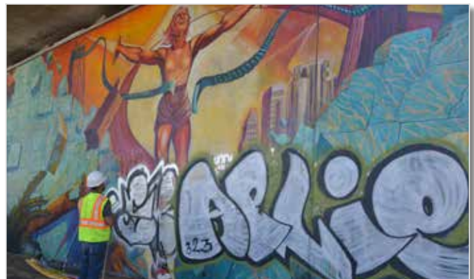
'Hitting the Wall' © Judy Baca (Los Angeles 110 Freeway)

"After applying MuralShield in conjunction with World's Best Graffiti Coating, the final outcome is a highly maintainable, durable and vibrant mural"