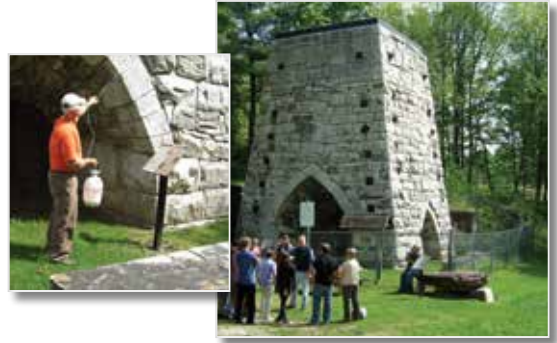
Friends of Beckley Furnace apply World's Best Graffiti Coating.

World's Best Graffiti Coating works in conjunction with MuralShield by offering long lasting protection for murals and artworks. See data sheet for further details.