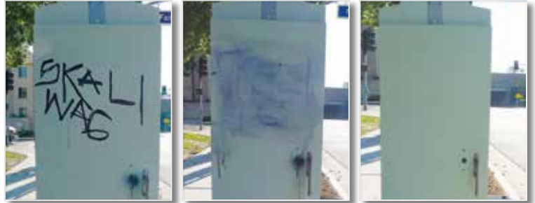
Removes ink stains from coated and painted surfaces.

1 Quart: Item WB0032 1 Gallon: Item WB0030 5 Gallon: Item WB0031