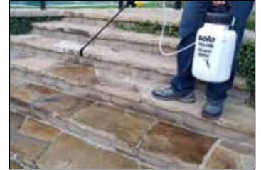
Ideal for natural stone that appears wet with water