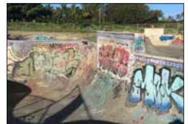
Can be used to protect horizontal surfaces, such as skate parks