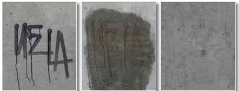
Removes ink stains from magic markers, leather dyes, boot polish etc. on porous surfaces such as concrete, stone, marble and terrazzo.