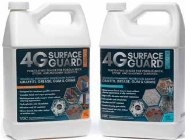
1 Gallon Walls: Item WB0152