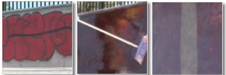
Feltpen Fadeout removes red spraycan stains from virtually any building surfaces, after or during removal using BBSM Graffiti Remover.