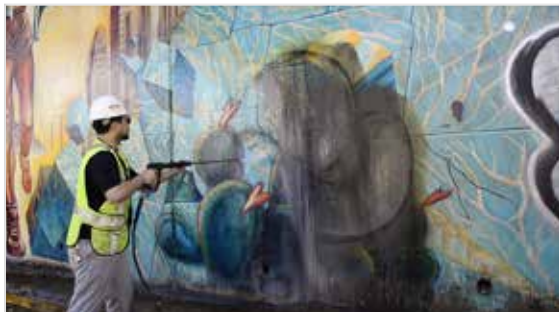
Cleaning graffiti after using Muralshield in conjunction with World's Best Graffiti Coating