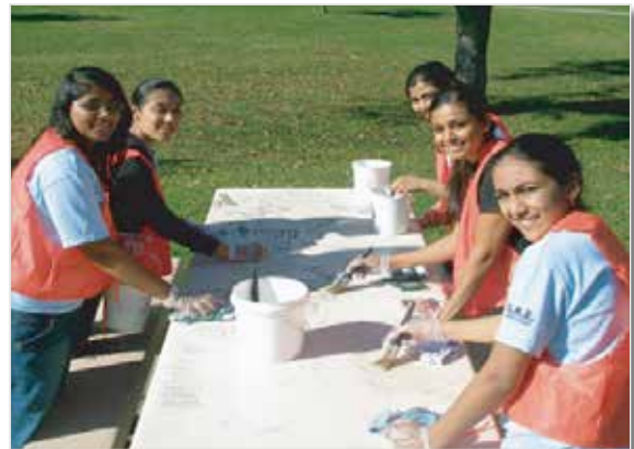
Community clean-up event Riverside, CA

(Available in cases of 12. Custom Labeling available upon request).