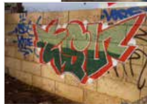
After applying the Coating, it is easy to remove graffiti with hot water alone, or with just one quick application of our removers.