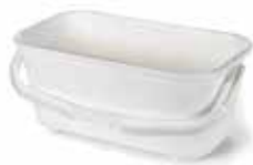
Item A0046 (Available in case of 3)

We've scoured the planet looking for the 'World's Best' graffiti removal applicators, suitable for applying our products. They're long lasting, chemically resistant and guaranteed to make your job a whole lot easier.