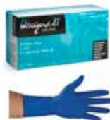
Item A0140 (Available in case of 50 & mastercase of 500)

Ideal for all brush-on / wipe-off applications or for flood coating our removers onto walls before pressure washing.