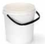
Item A0040 (Available in case of 12)

We love these handy buckets so much that we bring them in from Australia. Perfect for brooming up our removers on sidewalks, walls and concrete skate park bowls. Low profile allows for dragging along the ground. Square shape and compact design fits perfectly in the back of your truck.