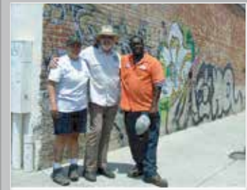
Demonstrations, Expert Training & Advice.