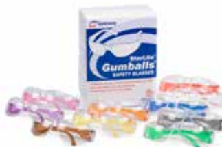
Item A0100 (Available in case of 10 & mastercase of 100)

Fits either hand, and is extra long and durable (8mm thick). Available in size XL only, which works best for everyone.