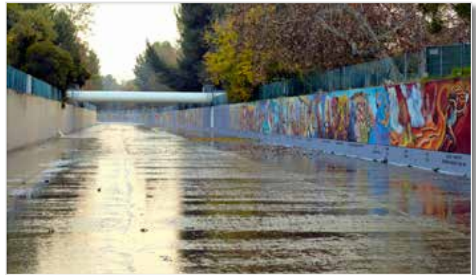
'The Great Wall of Los Angeles' © Judy Baca (the world's longest mural)

1 Gallon: Item WB0130 5 Gallon: Item WB0131