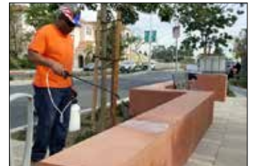
Used in high value, high traffic locations