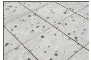
Makes cleaning gum easy, and prevents gum ghosts

4G Surface Guard makes porous walls or floors easy to clean without altering appearance.