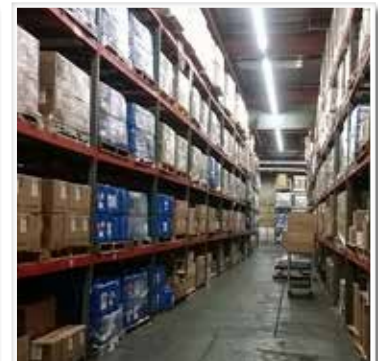
Urban Restoration Group US Inc Factory & Warehouse, Los Angeles CA