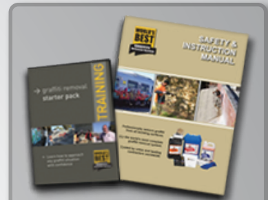
Training DVD & Manual included with every Starter Pack.