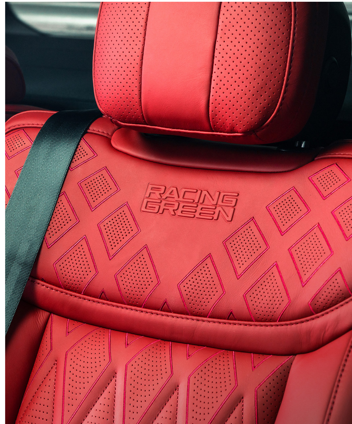
// Rand Rover interior by racing green automotive in the finest quilt and perforated red nappa leather