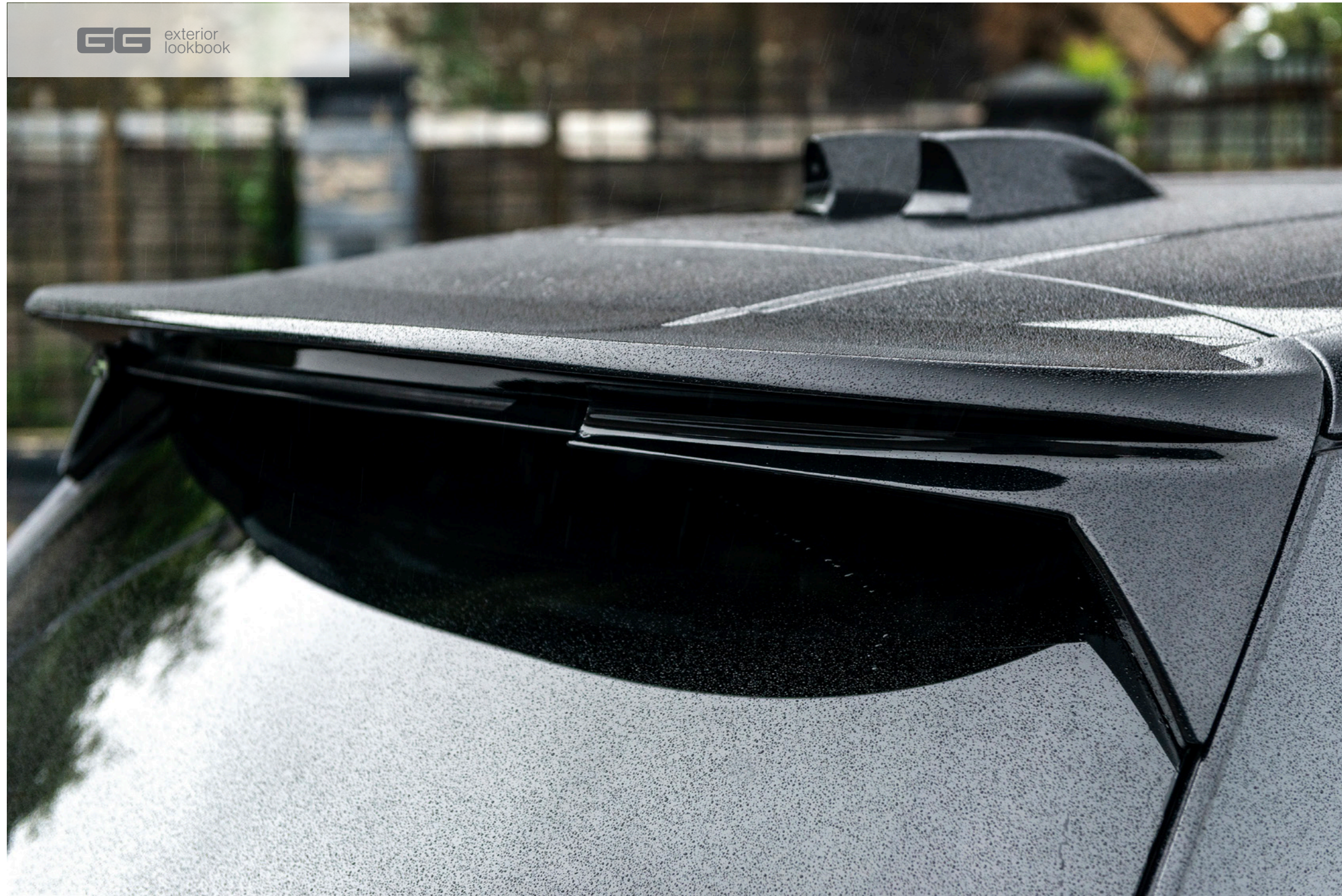
// racing green automotive rear upper roof wing