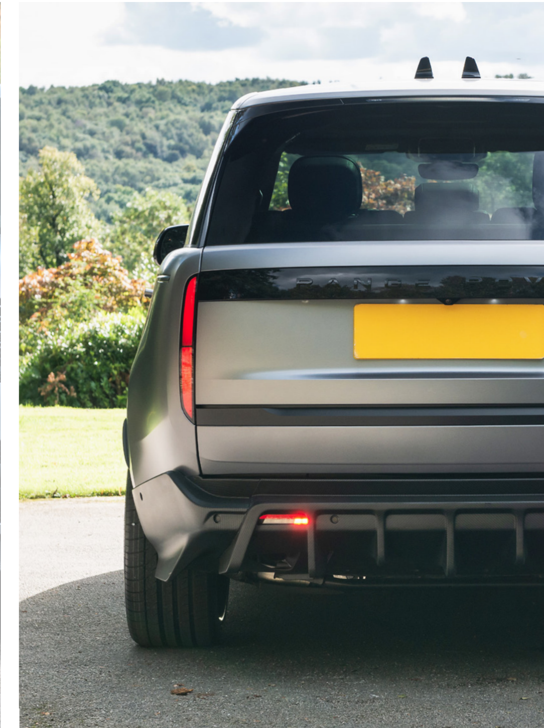
// Range Rover p400 fintail edition by racing green automotive in satin eiger grey wearing 24" type 60 forged wheels