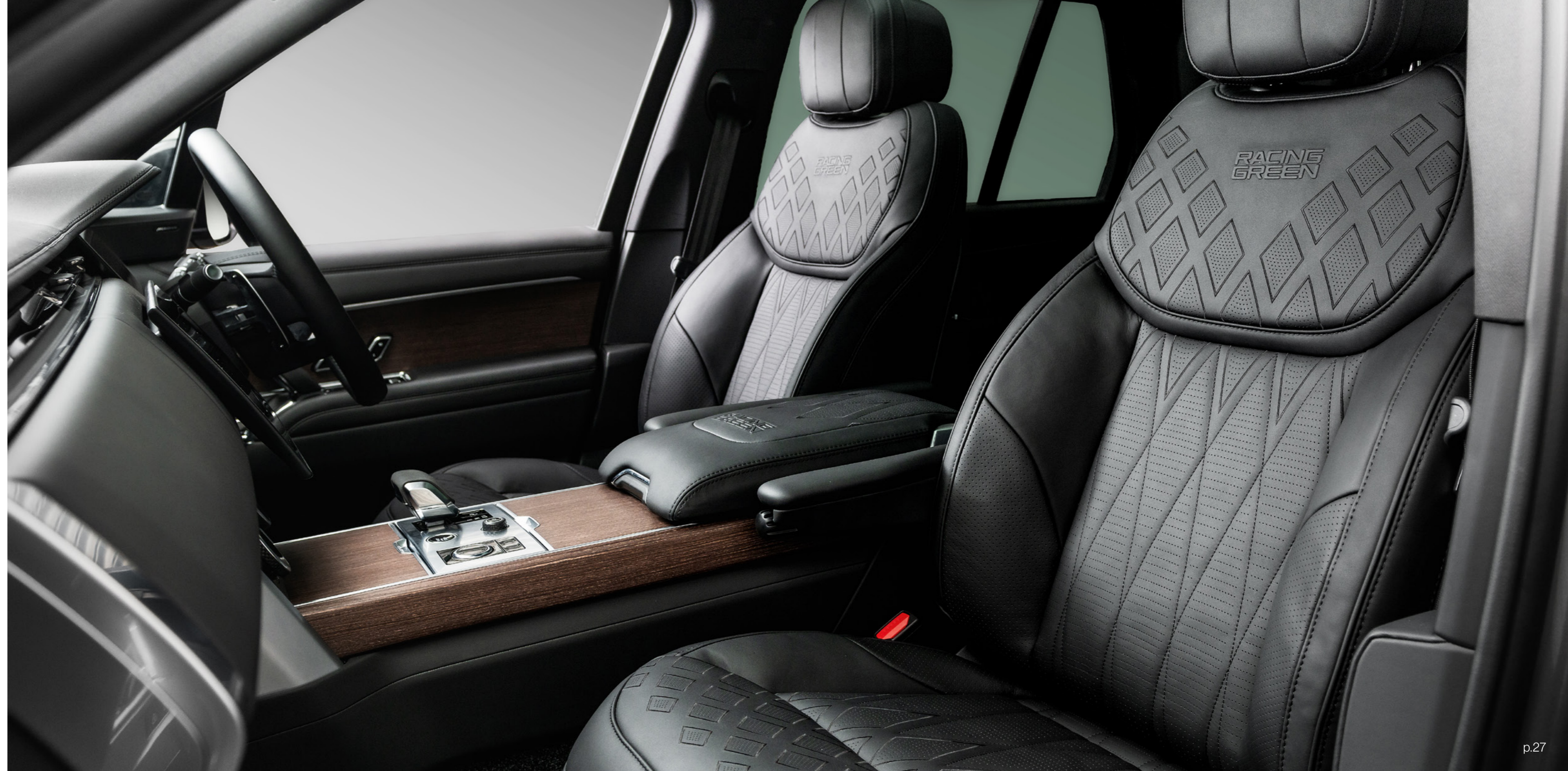
// embossed racing green branding details highlight the attention to detail