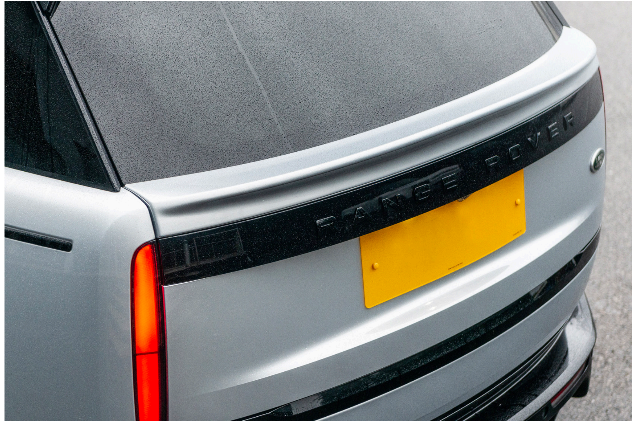
// racing green automotive rear lower boot spoiler