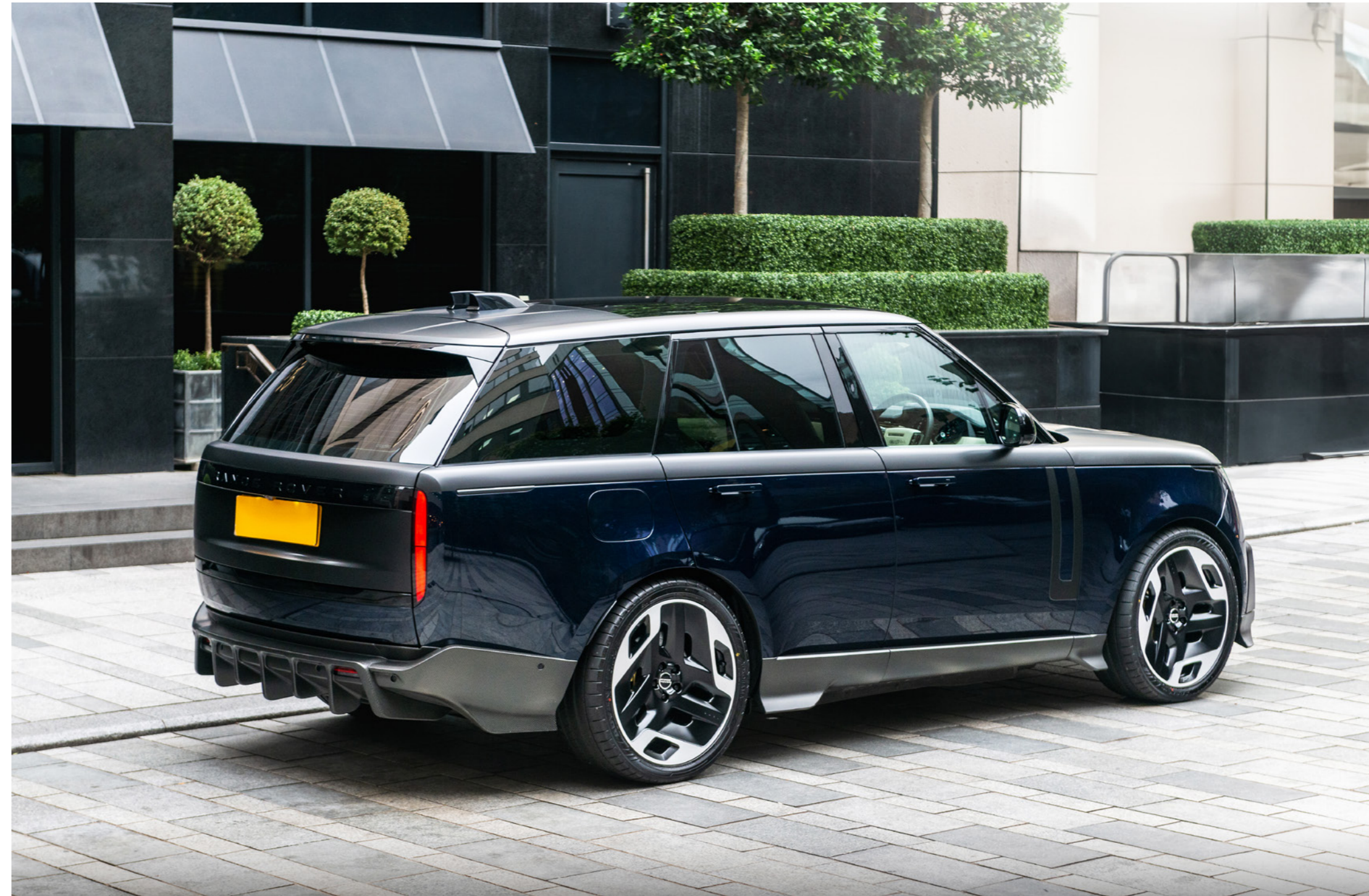
// Range Rover p400e fintail edition by racing green automotive in midnight portofino metallic blue with exposed carbon fibre vented bonnet wearing 24" type 33 forged wheels