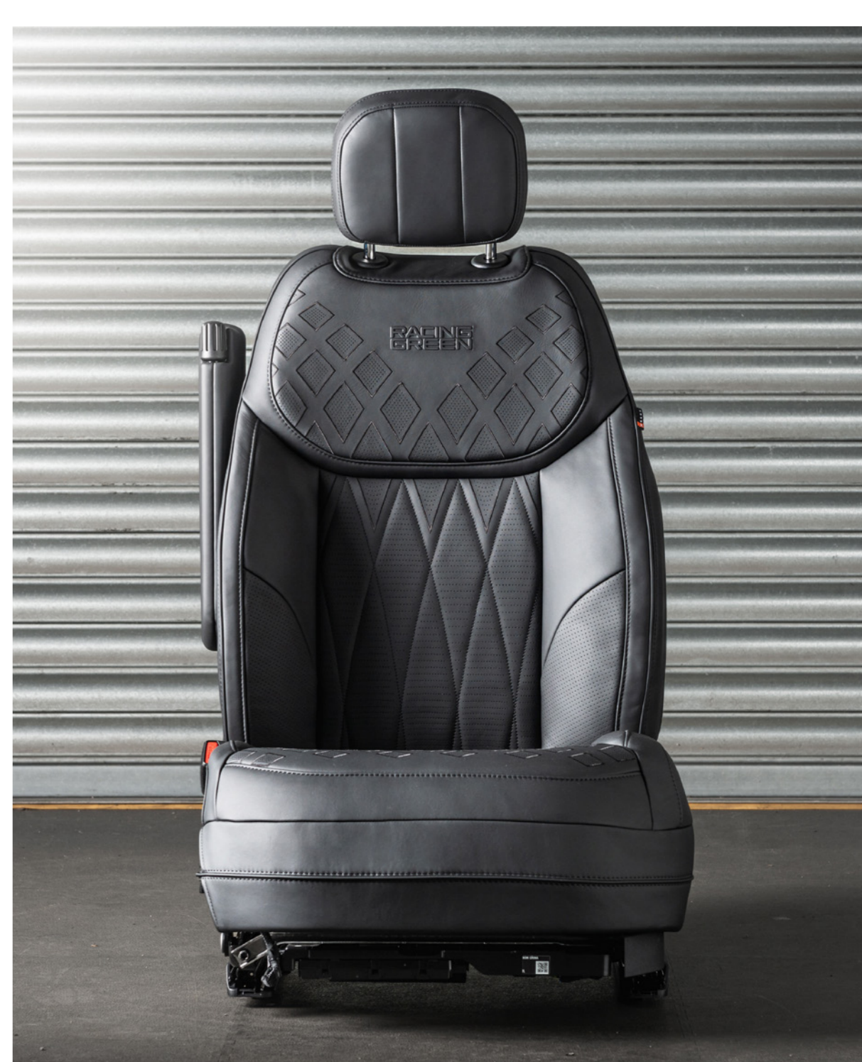
// Rand Rover interior by racing green automotive in the finest quilted and perforated black nappa leather