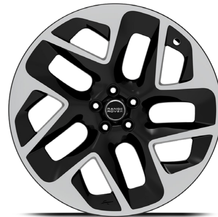
Finish: gloss black / diamond cut