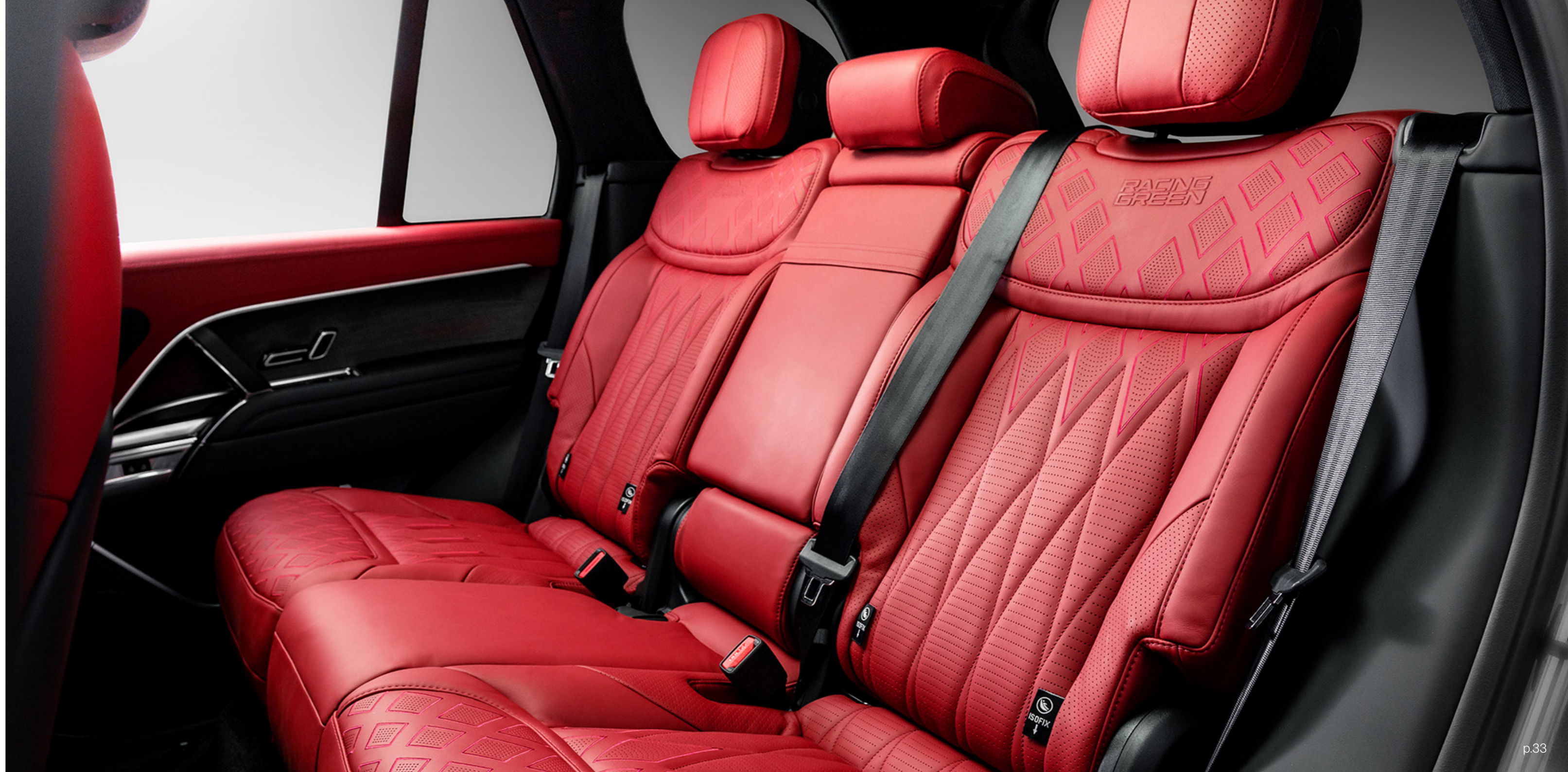
// embossed racing green branding details highlight the attention to detail