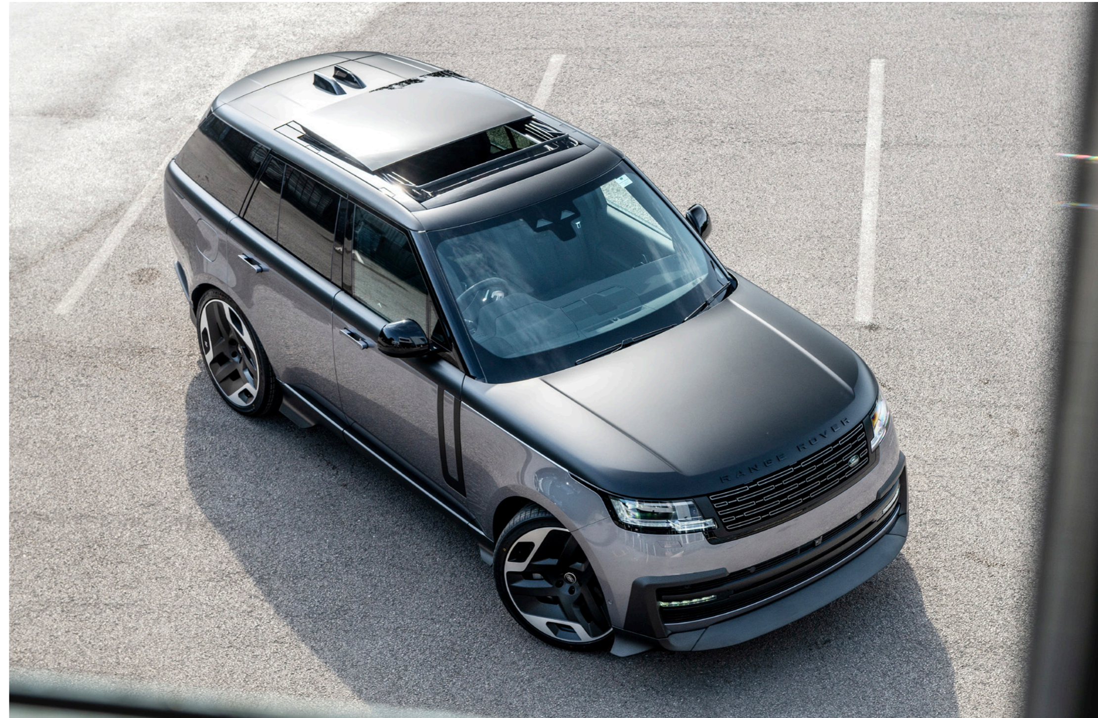
// Range Rover p400e fintail edition by racing green automotive in satin black over eiger grey wearing 24" type 33 forged wheels