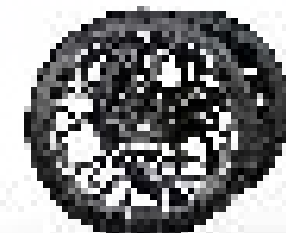
1 23" RS-FORGED TYPE 53 WHEELS