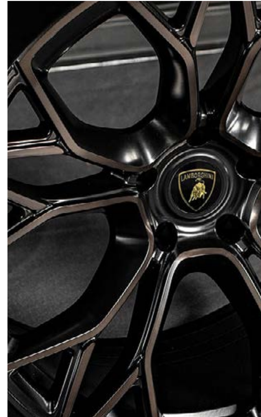
TYPE 53 RS-FORGED SIZE FRONT WHEEL: 10" X 23" SIZE REAR WHEEL: 11.5" X 23" COLOUR: SATIN BLACK/DIAMOND CUT TINT PART NUMBER: T53103SB01D17/T53113SB01DT