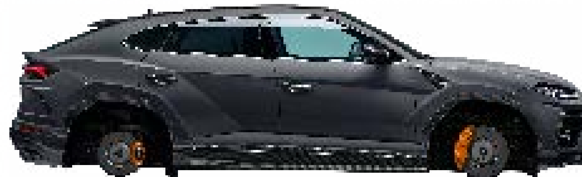
2 VENT WINGLETS IN ABS