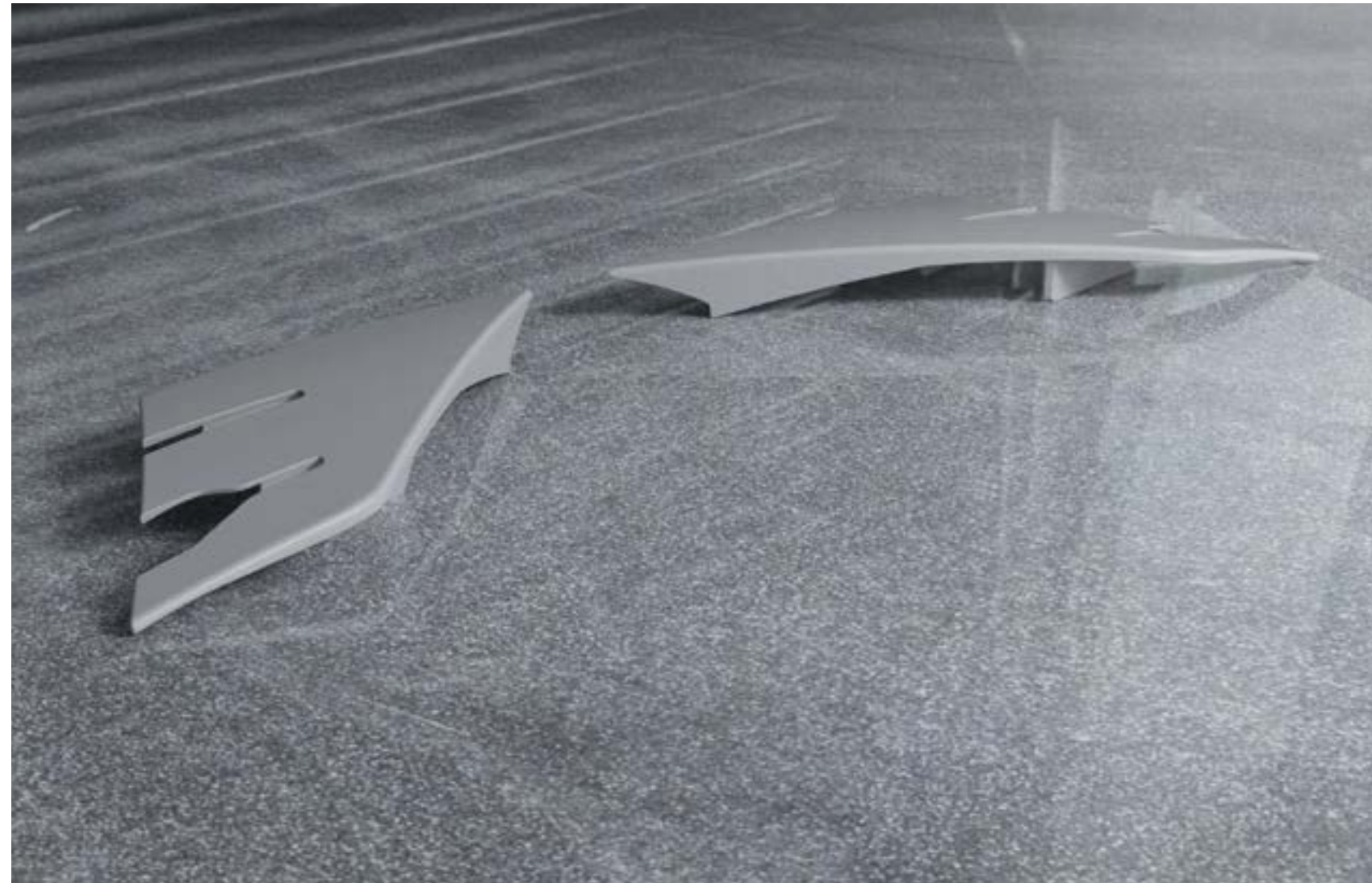
FRONT VENT WINGLETS MATERIAL: ABS COMPOSITE PART NUMBER: BKBLU2AB