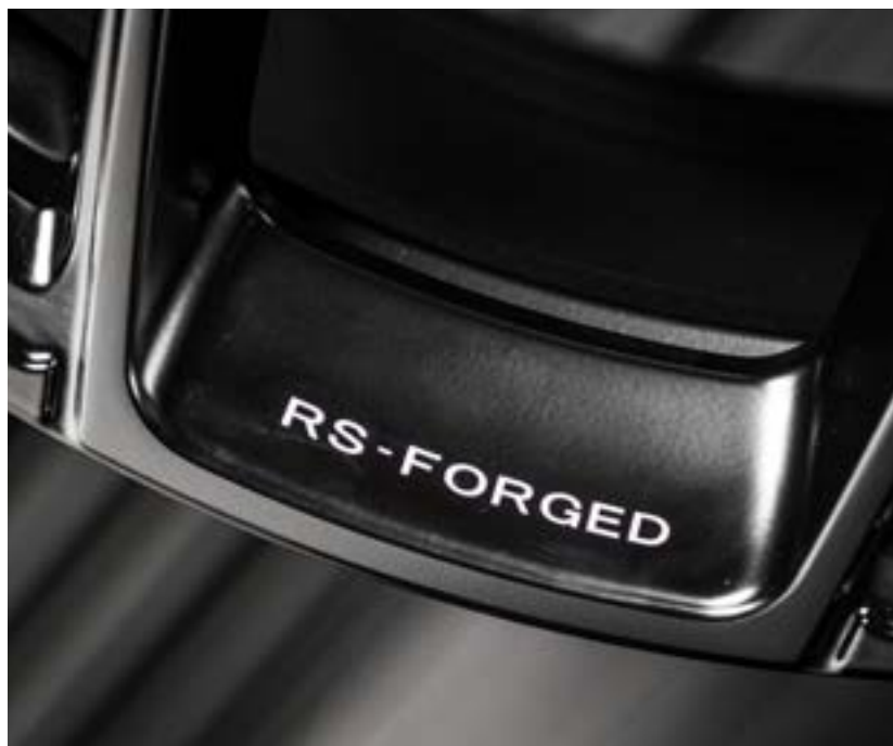
TYPE 53 RS-FORGED SIZE FRONT WHEEL: 10" X 23" SIZE REAR WHEEL: 11.5" X 23" COLOUR: SATIN BLACK PART NUMBER: WAKTF1267S1R/WAKTR1157S1R