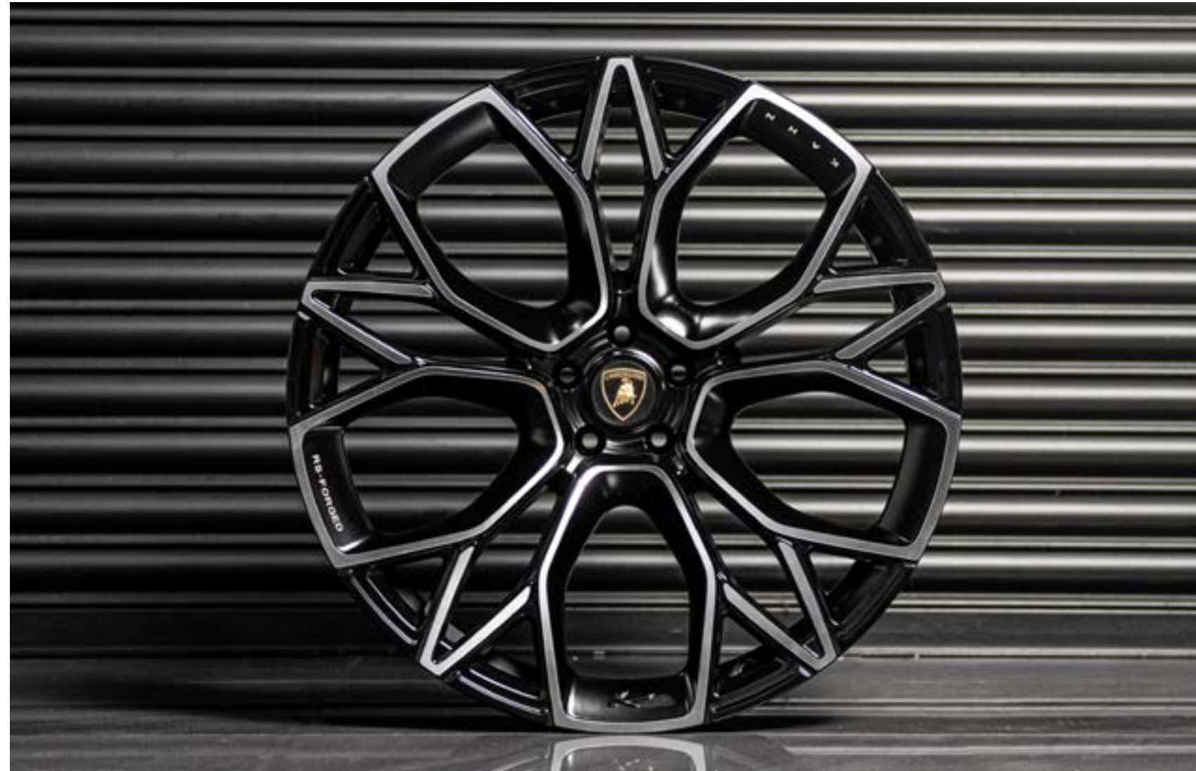
TYPE 53 RS-FORGED

SIZE FRONT WHEEL: 10" X 23" SIZE REAR WHEEL: 11.5" X 23" COLOUR: DIAMOND CUT | GLOSS BLACK PART NUMBER: T631035B01D/T631135B01D