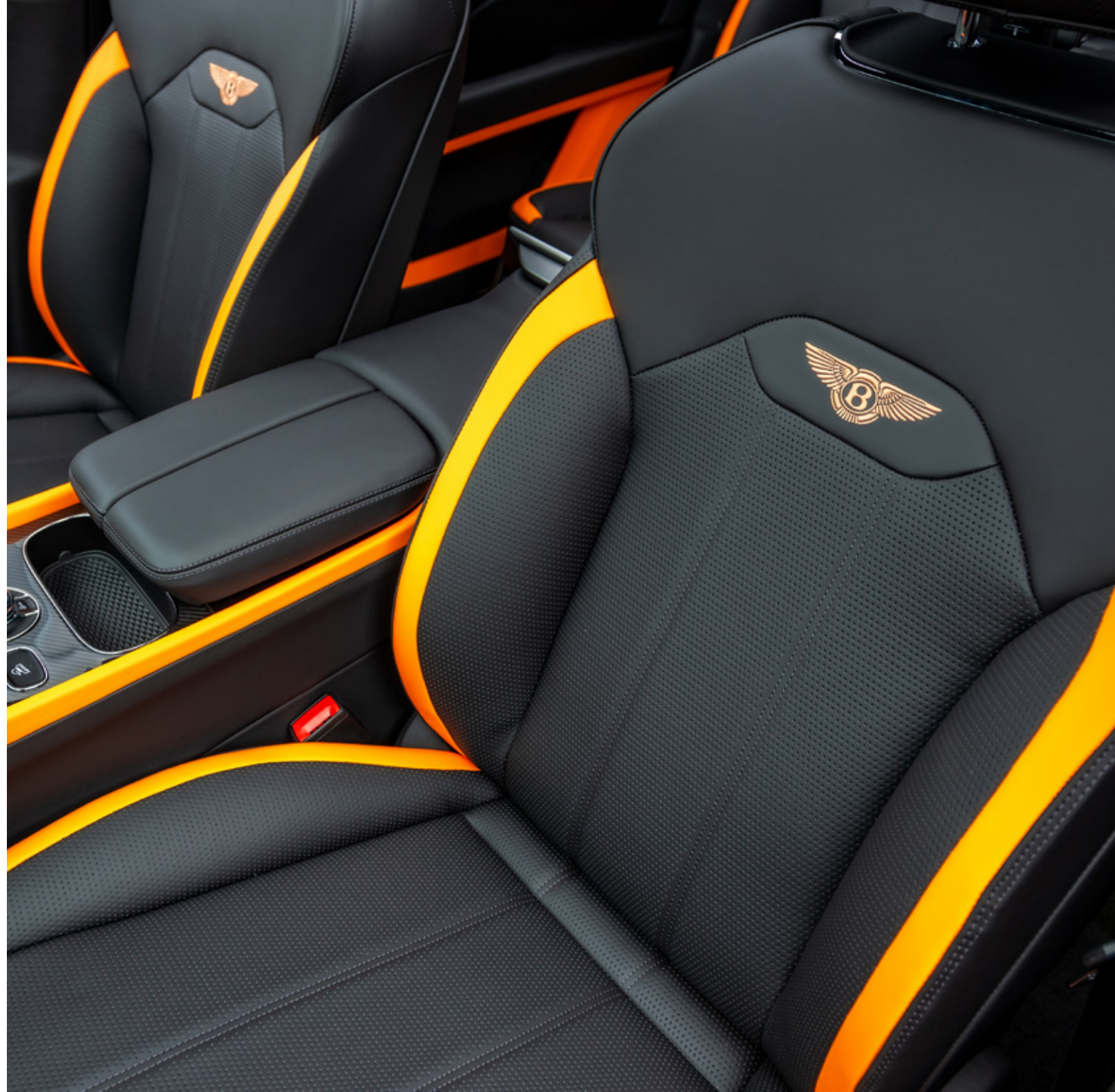
Front seats re-upholstered in Black / Mandarin bespoke leather