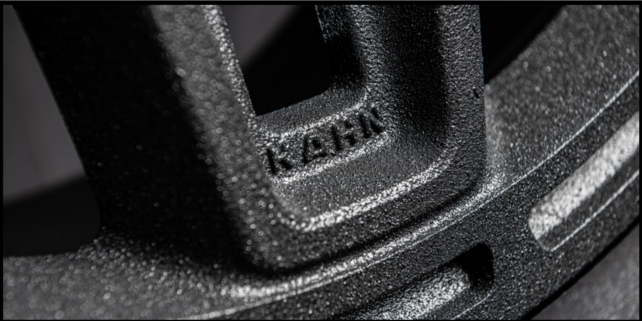
G06 9.5" x 22" in 3D Texture Finish