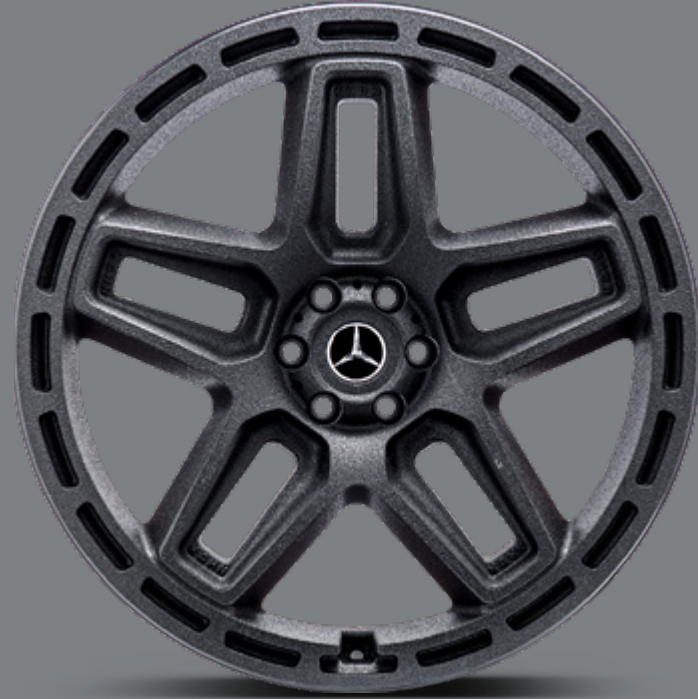
9.5" X 22" G06 3D TEXTURE FINISH SPECIAL ORDER ONLY £2,000.00 + VAT (SET OF 4)