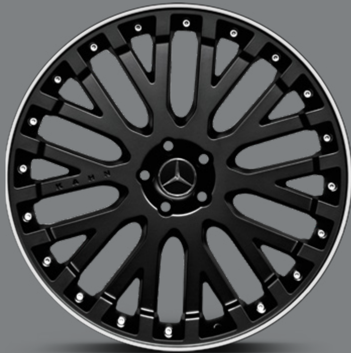
9.5" X 22" RSX SATIN BLACK & DIAMOND £1,665.84 + VAT (SET OF 4)