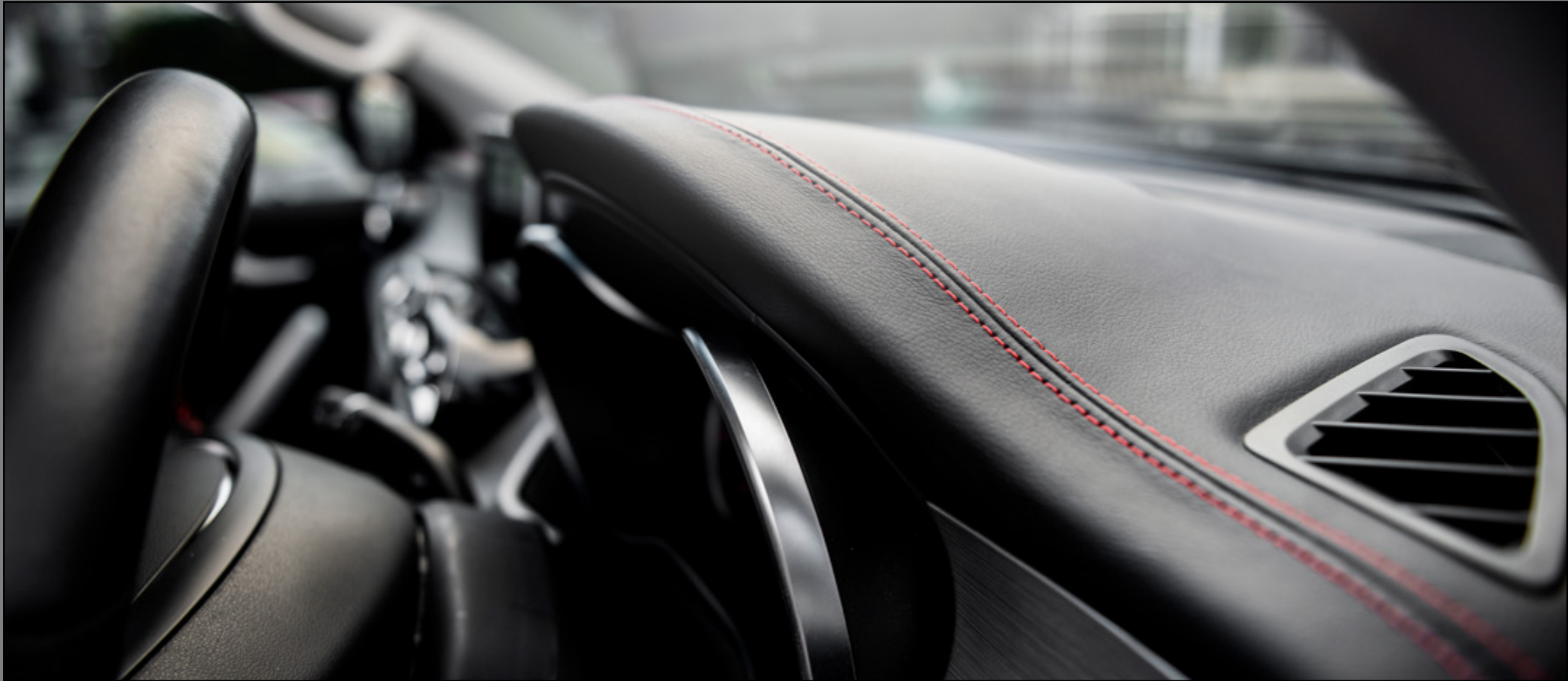
Dashboard Top (Including Binnacle & Door Tops) 03