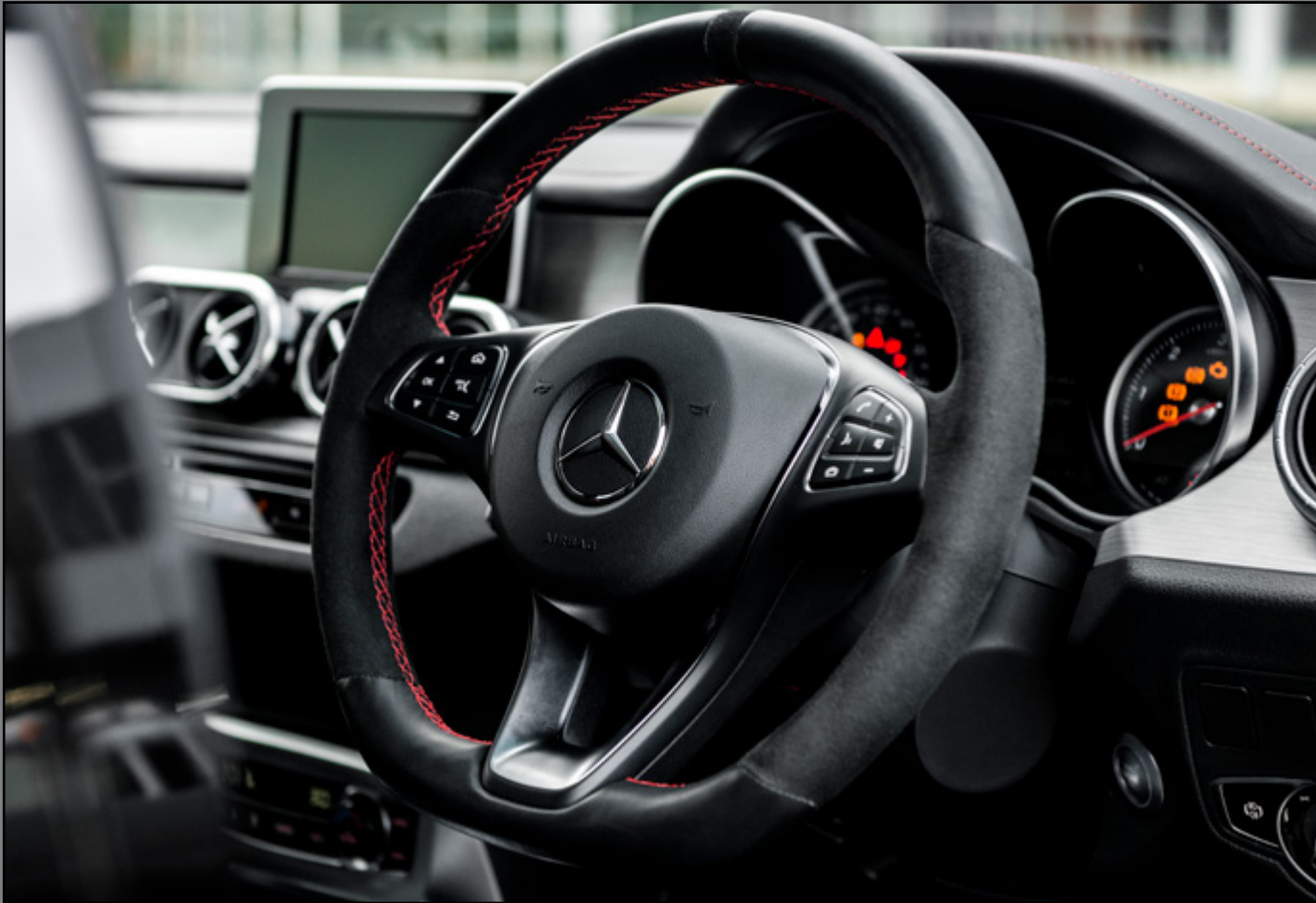
Sports GT Steering Wheel Available in a Choice of Colours 02