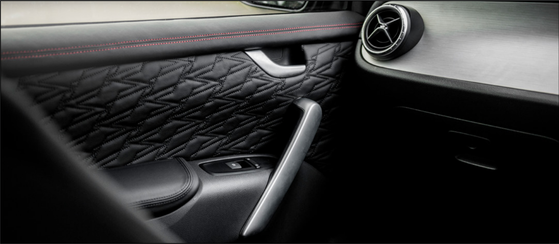
Door Panels with Signature K Branding (Set of 4) Available in a Choice of Colours 04