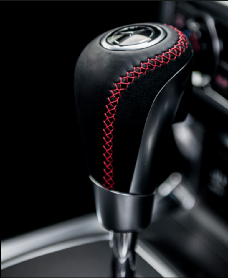
Stitched Gear Knob Available in a Choice of Colours 01