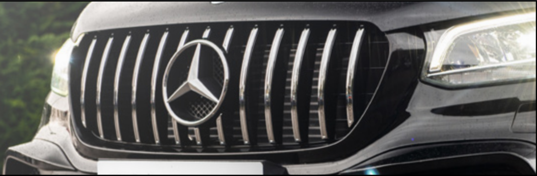
Front GT Grille