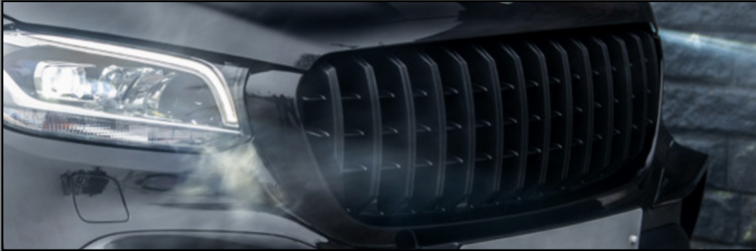
Front Concept Grille