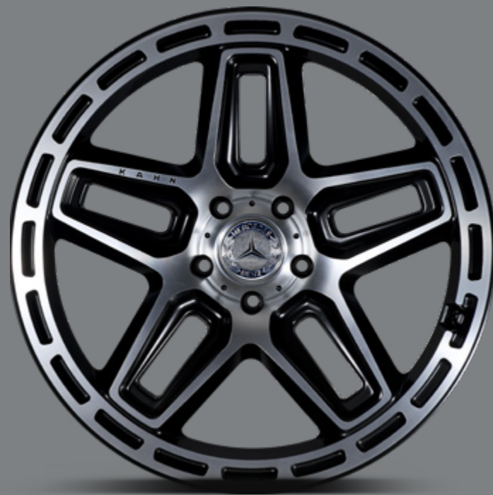
9.5" X 22" G06 SATIN BLACK & DIAMOND CUT £1,582.52 + VAT (SET OF 4)