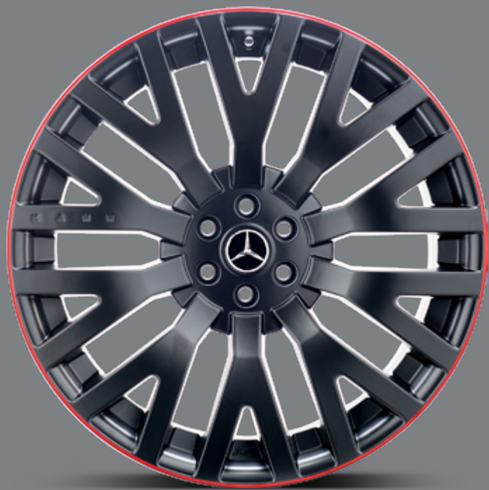
9.5" X 22" RS SATIN BLACK & DIAMOND £1,499.16 + VAT (SET OF 4)