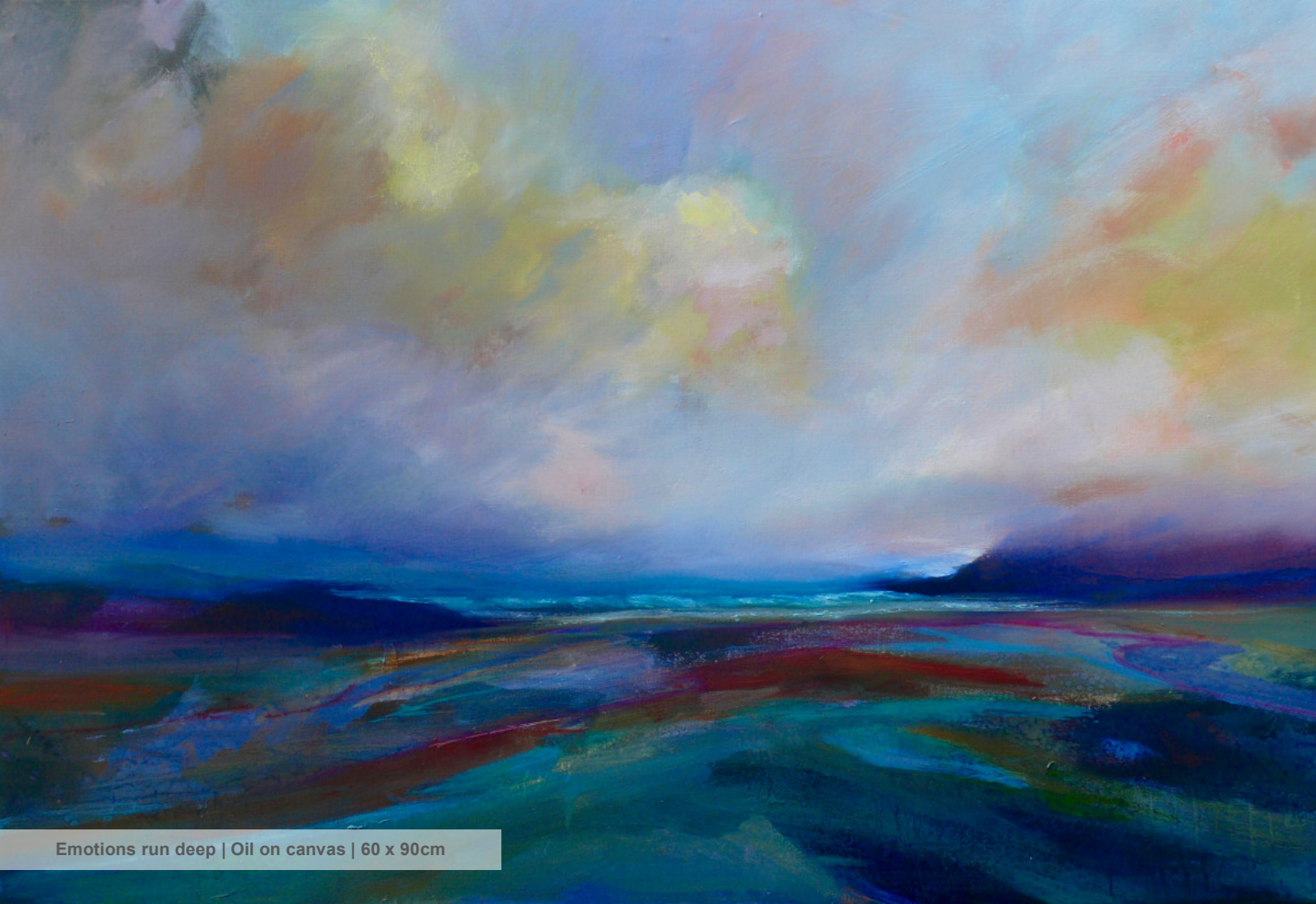
Emotions run deep | Oil on canvas | 60 x 90cm