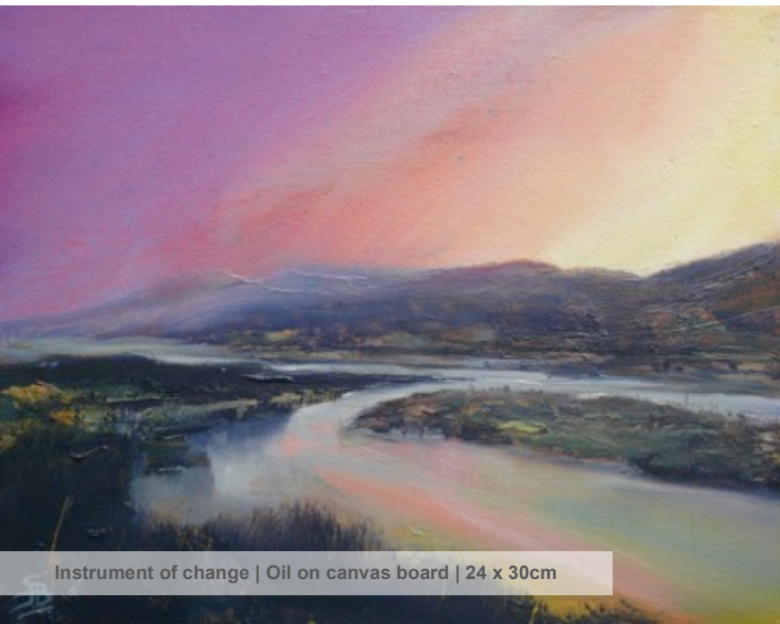
Instrument of change | Oil on canvas board | 24 x 30cm

Mall Galleries, exhibiting at the Cork Street Open exhibition and being selected for the Royal Cambrian Academy Open Exhibition in Conwy earlier this year. Upcoming events include a solo show at Off The Wall Gallery, Llandaff, Cardiff, 27th October to 21st November. Current work is available to view at Etcetera Gallery in St Davids, Off The Wall Gallery in Cardiff, the Russell Gallery in Putney, and the Discerner Gallery in Mayfair by appointment. For further information please visit www.sjbart.com .