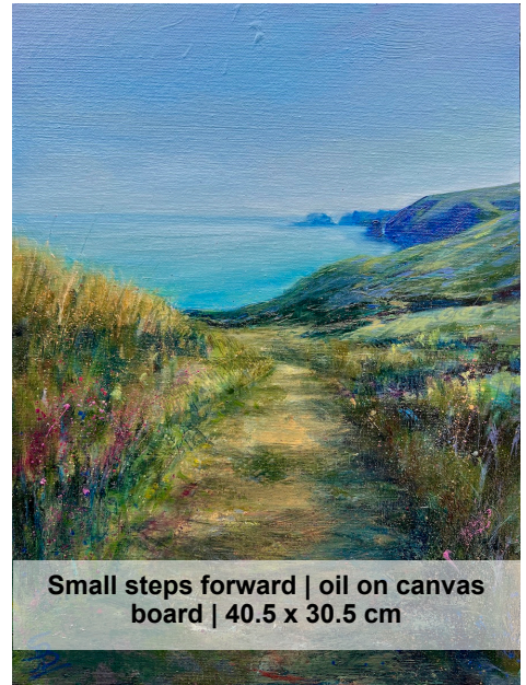
Small steps forward | oil on canvas board | 40.5 x 30.5 cm