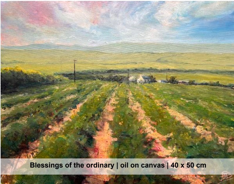
Blessings of the ordinary | oil on canvas | 40 x 50 cm